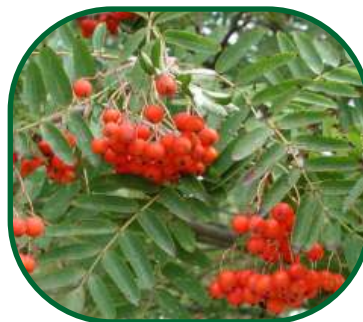
Mountain-ash or Dogberry